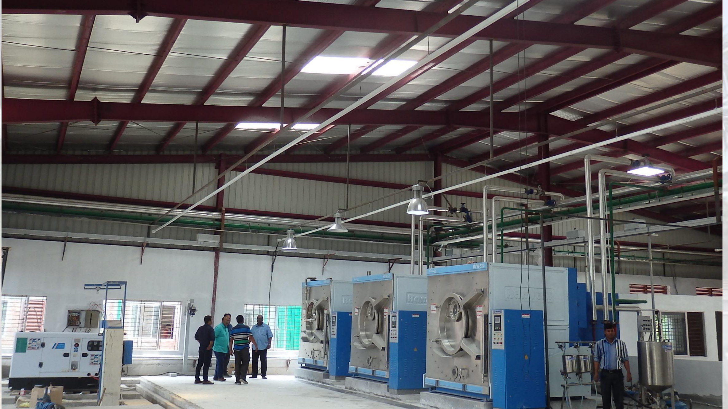
WET PROCESS AREA