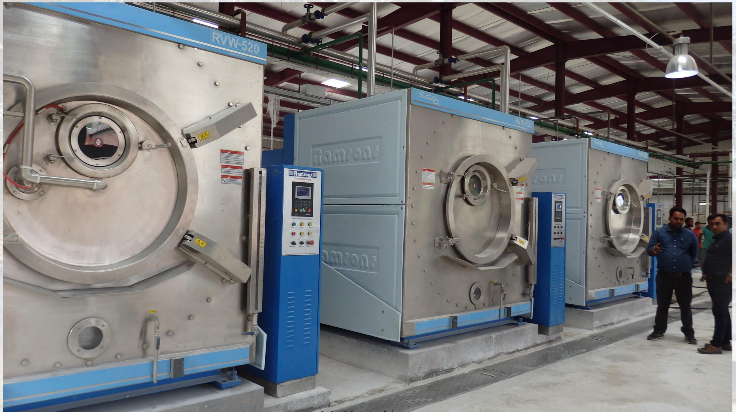
WET PROCESS Machines