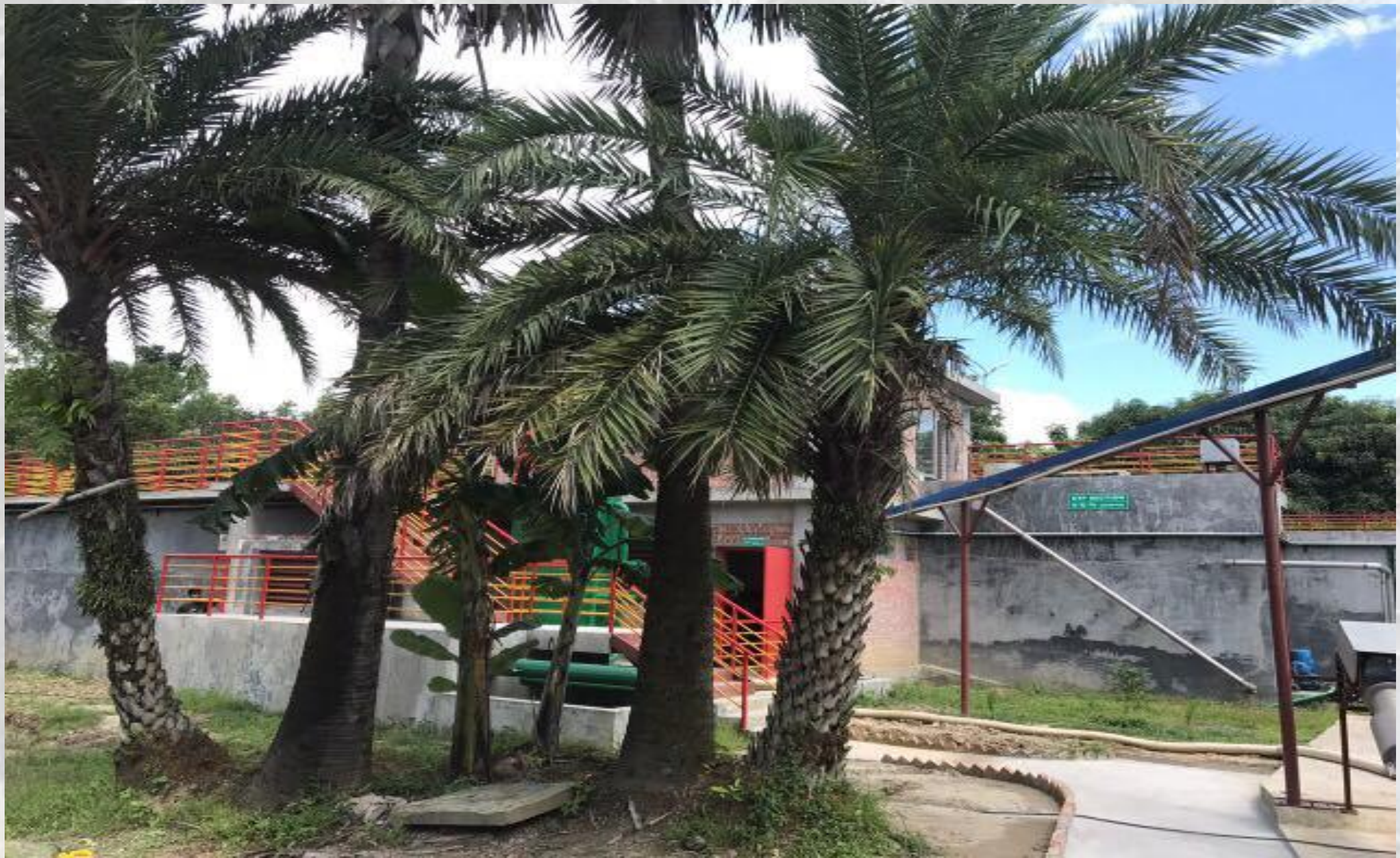
ETP FRONT VIEW